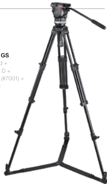
1002 System Ace M GS Ace M fluid head + tripod Ace 75/2 D + spreader SP 75 (#7001) + Ace bag (#9114)