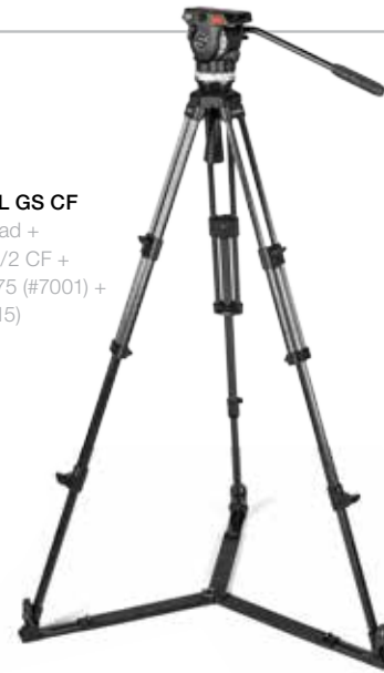
1012 System Ace L GS CF Ace L fluid head + tripod Ace 75/2 CF + spreader SP 75 (#7001) + Ace bag (#9115)